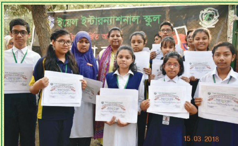
Achievers of STD III – VI

Achievers of Bangla Spelling & Rochona Lekha Protijogita and General Knowledge Competition "Bangla Hater Lekha Protijogita" for STD III – VI & "Bangla Rochona Lekha Protijogita" for STD VII - X were held on International Mother Language Day. Achievers of General Knowledge Competition was held on 18th February, 2018 are truly acknowledgeable.