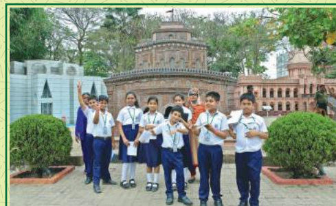
Replica of Kantaji Mandir