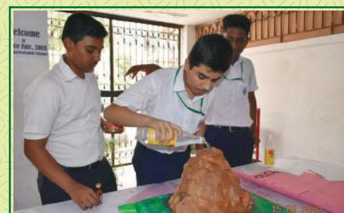
STD VIII (Or.) – Volcano Formation