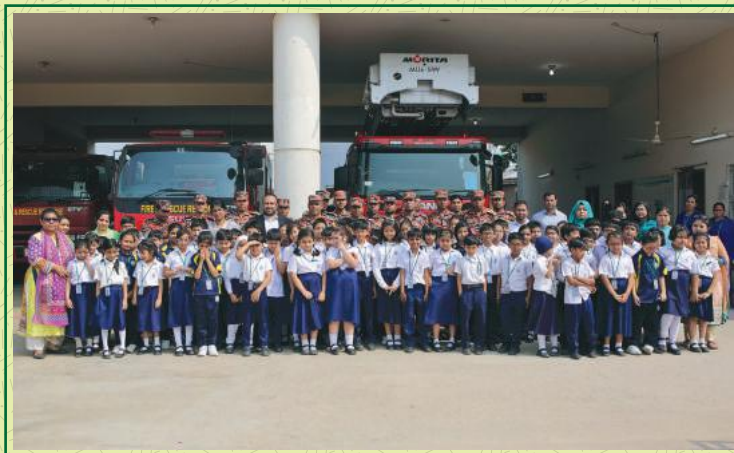
Group photo - STD I