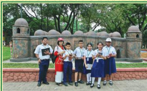
Replica of Shat Gombuj Masjid