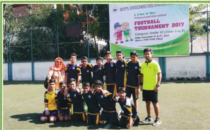
Primary Level Inter – School Football Tournament, 2017 hosted by ITHS.