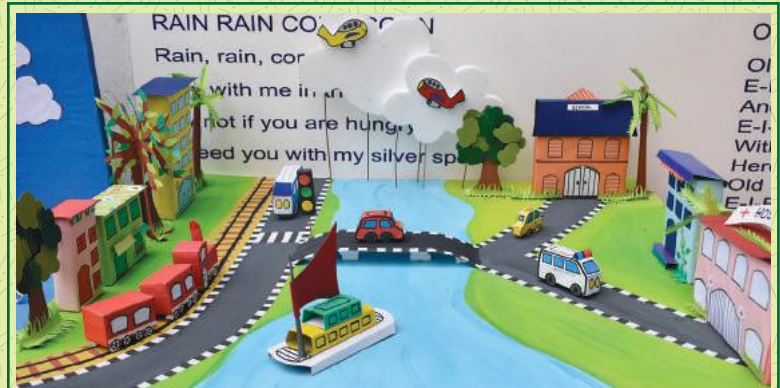
Project work on 'Transportation' by KG I