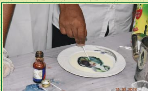
Colour Changing Milk