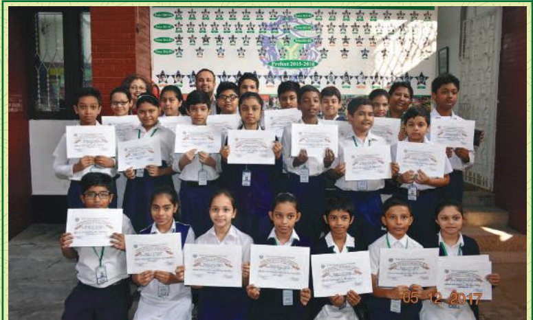
Spelling Bees & Story Writers of STD IV & V