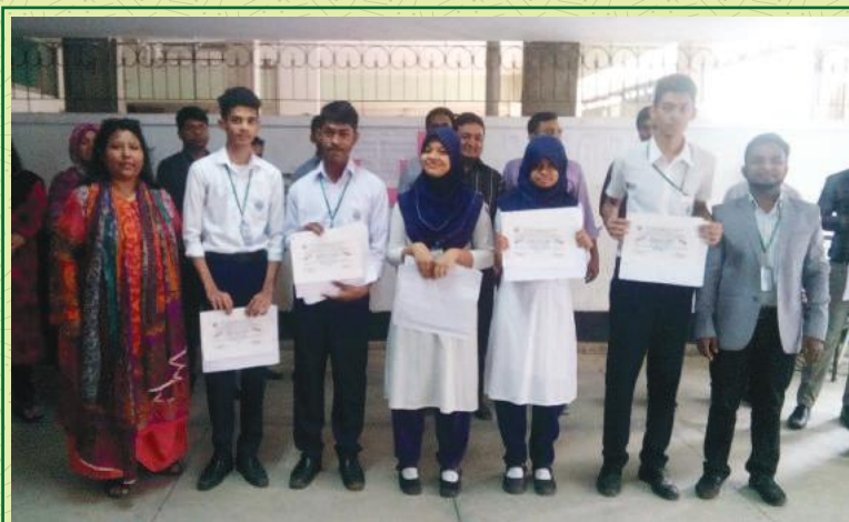
Achievers of STD VII - IX