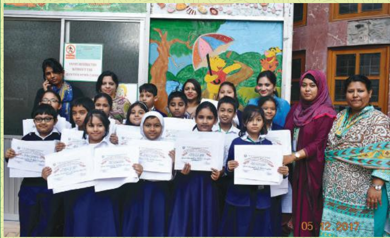
Achievers of STD I

Students of STD I & II participated in the Spelling & Picture Description Competitions on 5th November, 2017.. The best achievers were acknowledged by giving certificates.