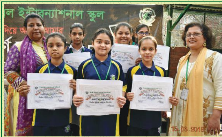
Students were acknowledged for showing their creativity in Making affiche on 'Plantation'