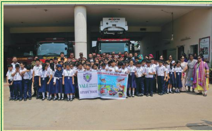
Group Photo – STD II