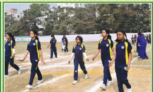
Moments of the Annual Sports