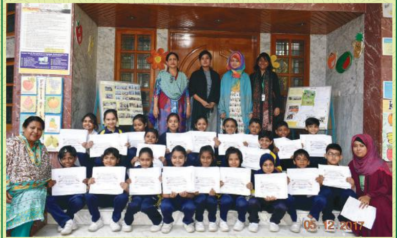
Achievers of STD II