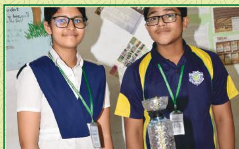
STD VII (Or.) – Heron Fountain