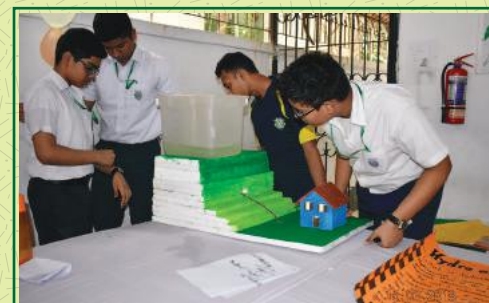
STD VIII (Gr. & Or.) – Hydroelectricity