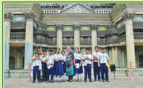
Replica of Puthia Jamidar Bari