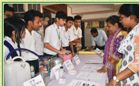
STD IX (Gr.) – Bio – fuel (ethanol)