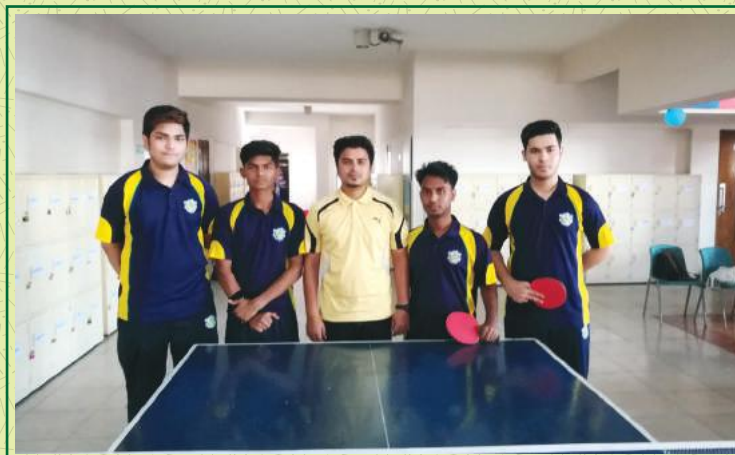
DPS Inter – School Table Tennis Tournament

Some precious pieces of art Done by the students of STD I - VI