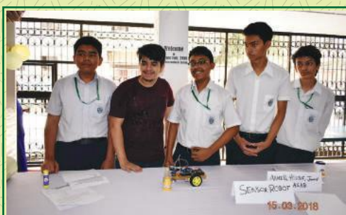
STD IX (Gr.) – Obstacle Avoiding Sensor Robot