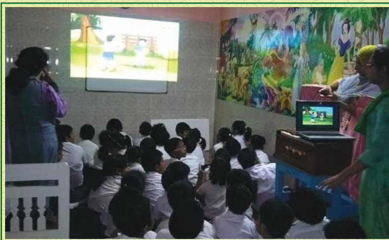
Multimedia Class for KG II on Behaviour