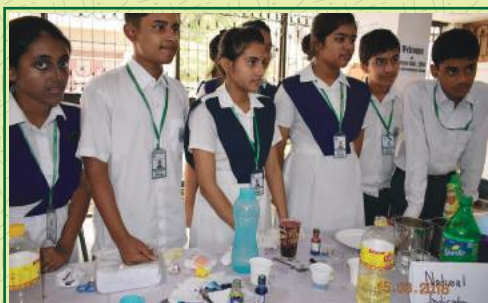
STD VII (Gr. & Or.) – Lava Lamp, Colour Changing Milk & Natural Indicator.

Annual Science Fair was held on 15th & 16th March, 2018 by the students of STD VII - X