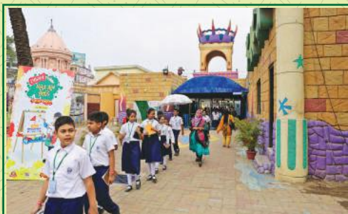
Entering the Heritage Park

A study tour for STD III students was arranged on March 28, 2018. They visited the 'Concord Heritage Park', Ashulia. Through this tour the students knew about the different historical monuments of Bangladesh.