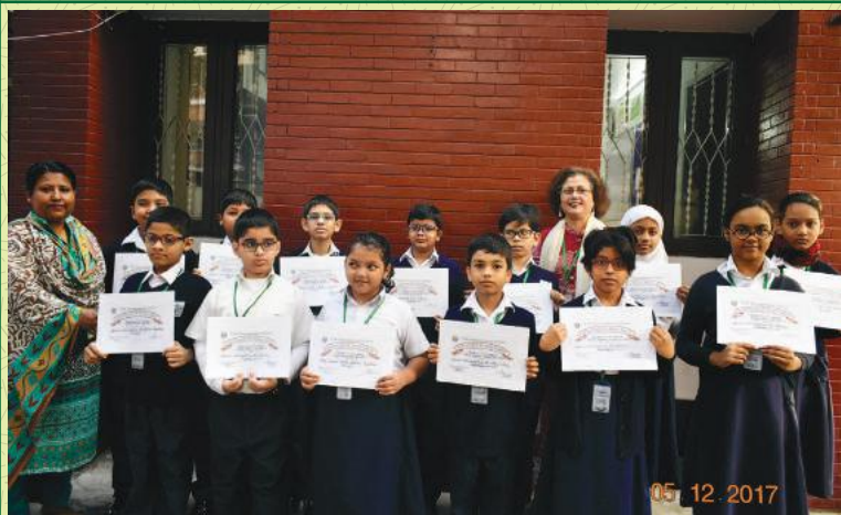
Spelling Bees of STD III

Spelling Competition for STD III-V and Story Writing Competition for STD IV – V were arranged by YALE 12th November, 2017. Here are the photos of the winners with the certificates.