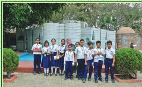
National Assembly Building (Replica)