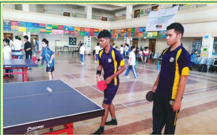
DPS Inter – School Table Tennis Tournament

YALE students from the Senior section participated in different Inter – school competitions. Here are the photographs of those events.